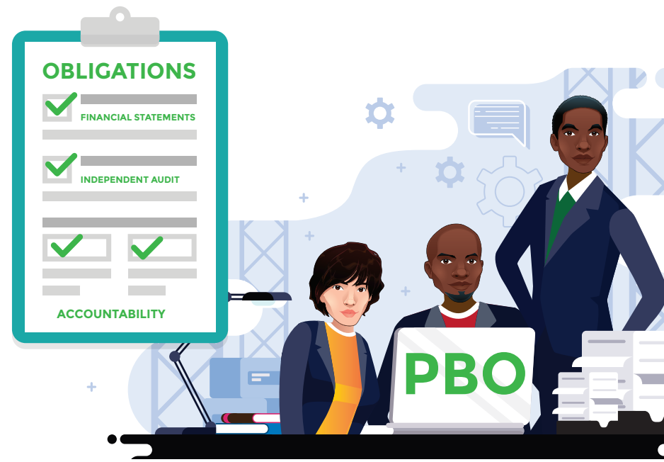
PBOs must abide by the requirements in the PBO Act in section 27.

PBOs must abide by the requirements in the PBO Act. The Act demands good leadership from PBOs. It outlines a list of principles that PBOs must observe in section 27. For example, PBOs must practice transparency and accountability, follow conflict of interest principles and keep high standards of professionalism. They should also promote democracy, human rights, the rule of law, good governance and justice for Kenyans and be committed to peaceful and non-violent ways in all their activities (Section 25(2), (3), 27(1) (a) (b) (j)).