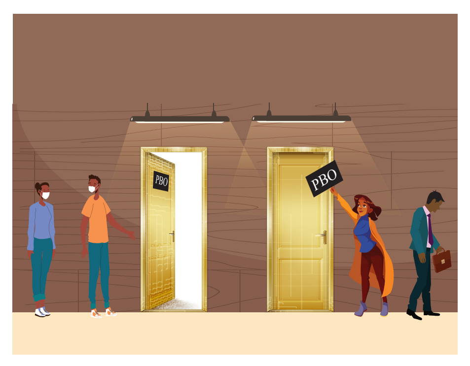
PBOs that freely choose to shut down their operations must send a written notice to the Director General of the PBO Authority within 60 days.

The notice must include the reasons for the decision to wind-up or dissolve and the date when the organization is to cease to exist. The PBO must also give the Authority copies of all relevant documents confirming the winding up or dissolution, and a copy of the written report, financial statements and an auditor's report for the period running from its previous financial year up to the date of the written notice (section 61 (1-3)).