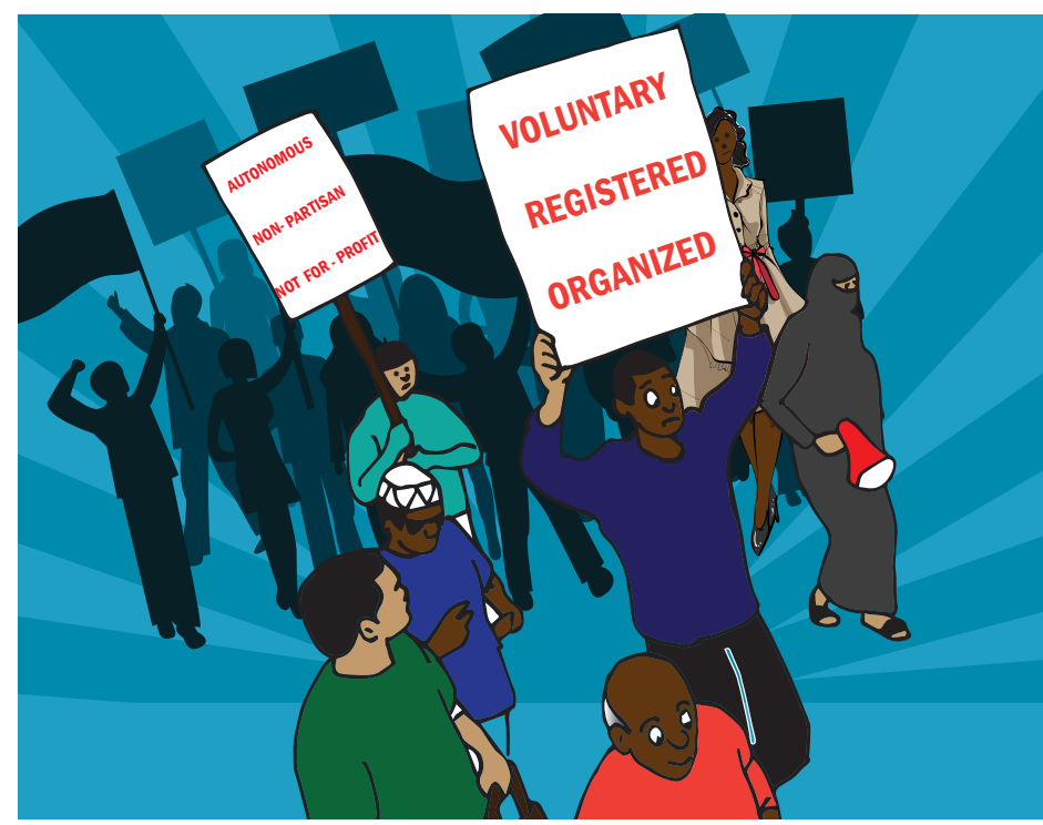
A PBO is a voluntary membership or non-membership grouping of individuals or organizations, which is autonomous, non-partisan, non-profit making operating locally, nationally or internationally, engaging in Public Benefit Activities.

The definition of public benefit activity covers a wide range of activities that PBOs can involve themselves in. The Sixth Schedule of the Act provides a list of public benefit activities. The list is not exclusive but when read together with the definition in section 2(1), provides a useful guide to PBOs and the PBO Authority on what constitutes a public benefit activity.