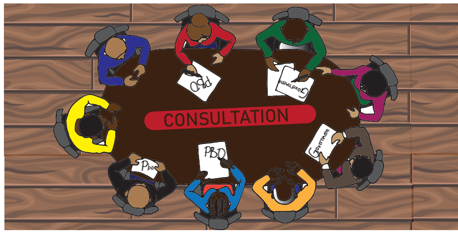
The Government has a duty to involve PBOs at the national and local levels in policy making processes.

Is it illegal to form or join or operate an association for the benefit of the public without registering it as a PBO? The principle of the freedom of association in the Constitution gives all Kenyans a right to get together and form associations of any kind, including formal or informal groups, without necessarily registering them. However, registered organizations receive the benefit of formal recognition. The PBO Act does not recognize CSOs that are not registered under it, as PBOs. While associations are encouraged to register, they are not required to do so.