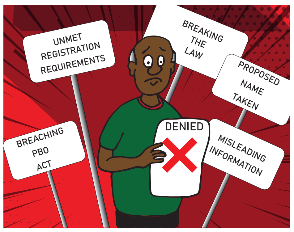
The Authority can refuse to register any organization as a PBO with reasons.

5. The Public Benefit Organizations Disputes Tribunal is set up by the PBO Act (Section 50(1)) as an independent mechanism of complaint and redress.