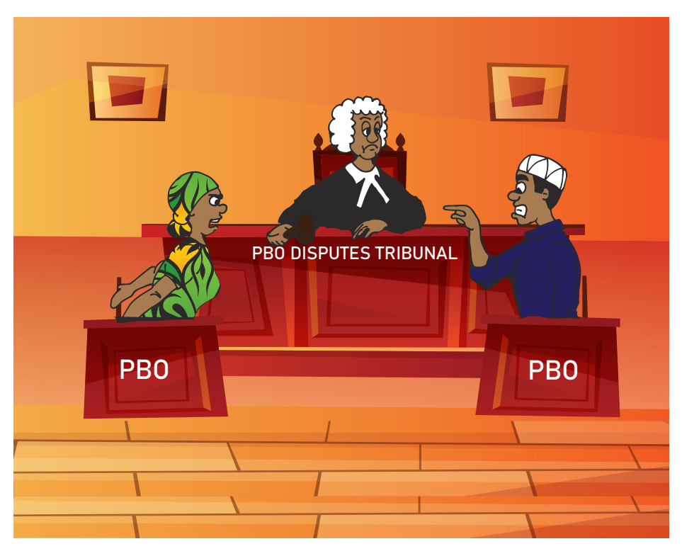
The Public Benefit Organizations Disputes Tribunal will have power to hear and reach decisions regarding complaints that break the provisions of the PBO Act.

A Tribunal to be known as the Public Benefit Organizations Disputes Tribunal is set up by the PBO Act (Section 50(1)) as an independent mechanism of complaint and redress.