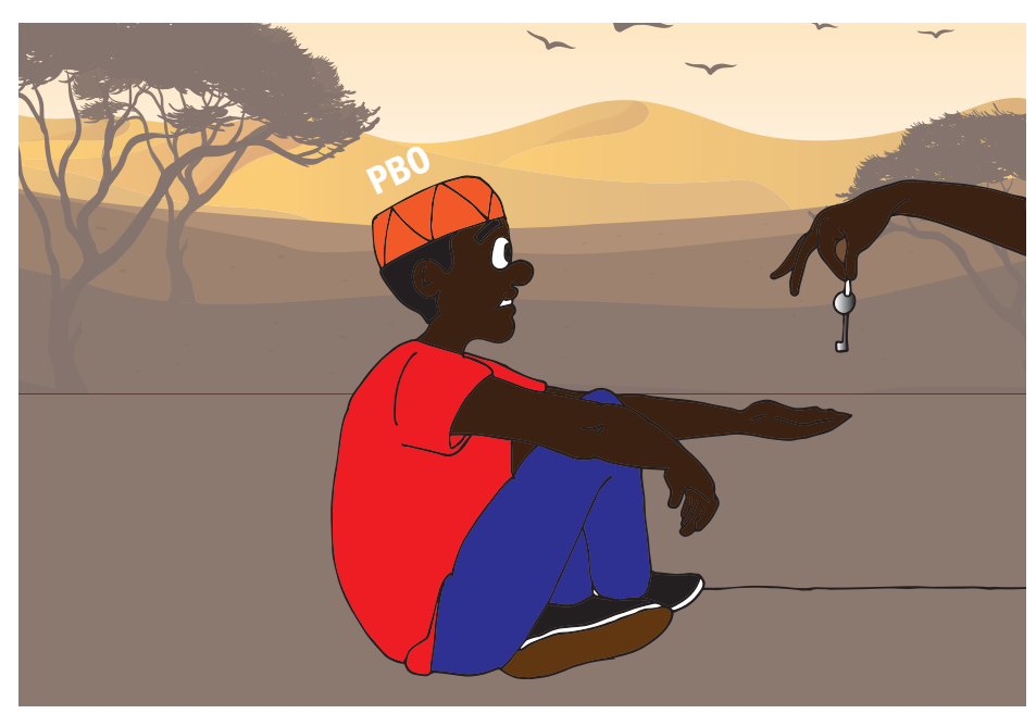
The PBO Act allows PBOs to form independent self-regulation bodies or forums to develop their own code of conduct and standards.

The PBO Act allows PBOs to form independent self-regulation bodies or forums (section 28(1)) and to organise themselves into a federation of forums in order to boost self-regulation (Section 24(2)). The Act permits the PBO forums to develop their own code of conduct and standards and to ensure that their members apply these (section 24(1), 28(1)).