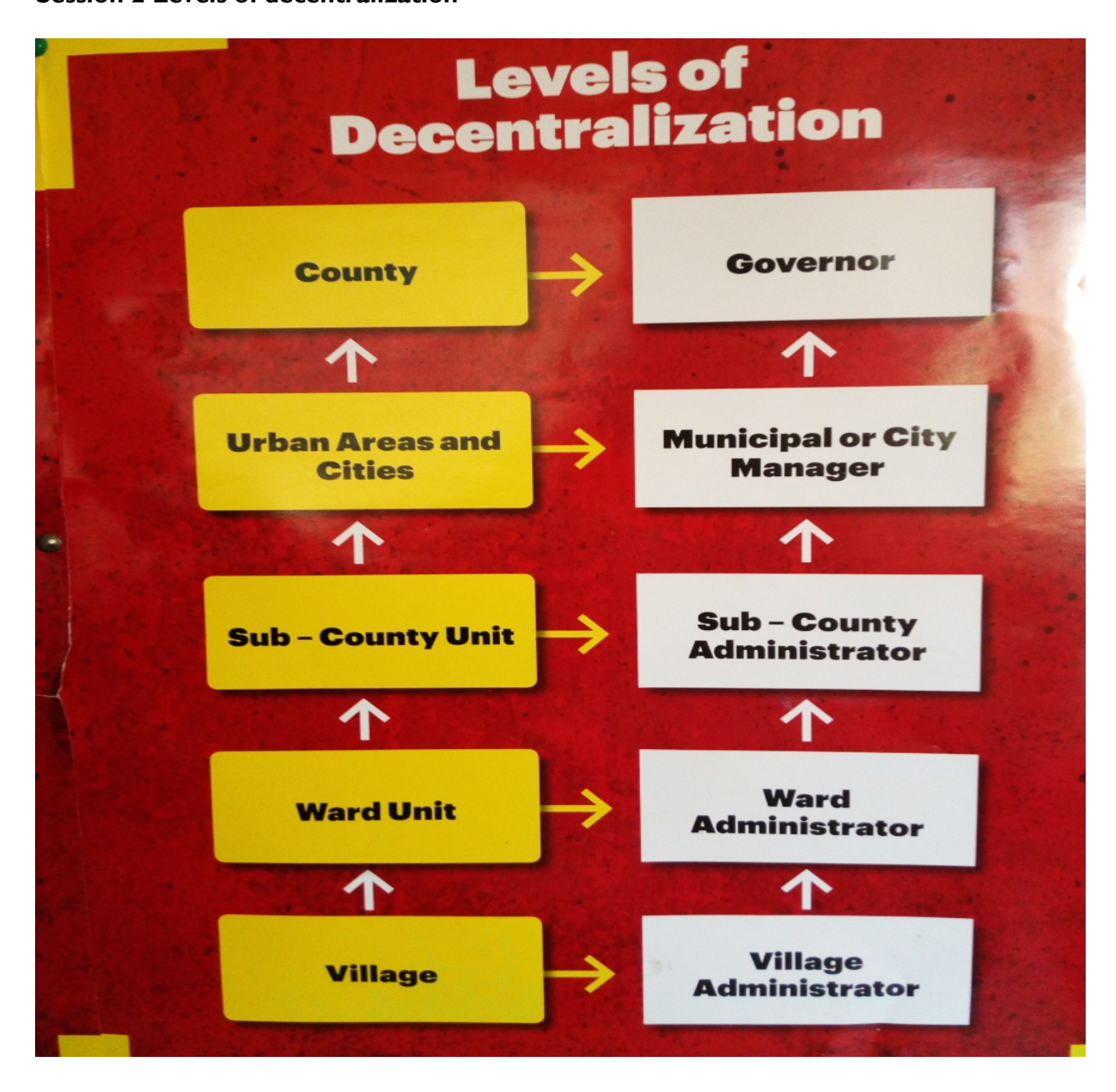
Session 2 Levels of decentralization